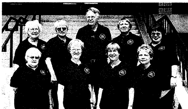
The CSPC Handbell Choir recently attended a hands-on seminar at DePauw University. The group is hopeful to recruit new members and everyone is welcome.