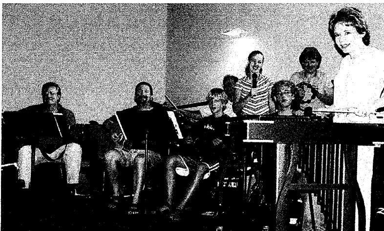
The ages of the praise band range from 14-56. The band has a love for all types of music and performs at church fellowship events as “Purple Monkey and the Grace Notes.”

Several years ago, the decision was made to have two distinct worship services: a more “contemporary” style at the 8:30 a.m. service and a “traditional”-based service at the 11:00 a.m. This decision influenced the style of music to be played at both services.