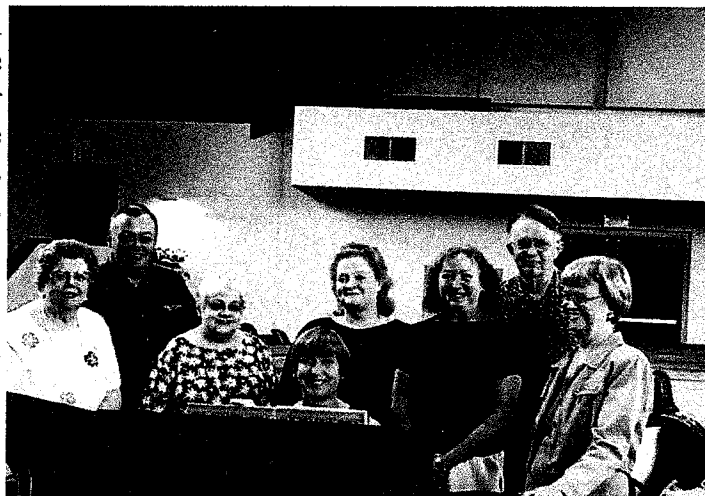
The CSPC Voice Choir welcomes you to join and sing God’s praises with them at the 11:00 service. New members wanted!!